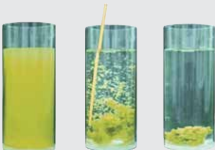
Example of a flocculation process

No single flocculant or coagulant can remove everything from the water. APF is a precise combination of 6 different electrolytes and polyelectrolytes to cover the widest possible range. Dissolved constituents of water make up 80 % of the oxidation demand and suspended solids around 20 %. Everything that is filtered out does not need to be oxidized. When the correct flocculation is used in combination with AFM®, chlorine consumption and the production of unwanted chlorine by-products are reduced by up to 80 %.