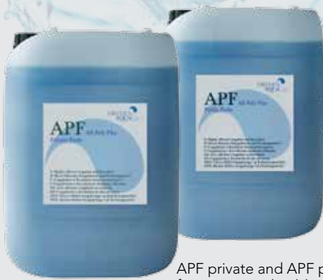
APF private and APF public: for private and public swimmingpools

For the best coagulation and flocculation